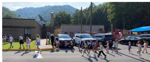
Students practice fire drill procedures on the 2 nd day of school.

Burch PK8 is proud to announce we will be partnering with Williamson Health & Wellness to provide a school-based clinic in our building. They will work in conjunction with our school nurse and can provide services with parental consent. Behavioral health services are already in place, and once the clinic is fully up and running, additional services, such as telehealth, primary care, and testing for flu/Strep/COVID-19, will be available. More information will be sent home in the near future.